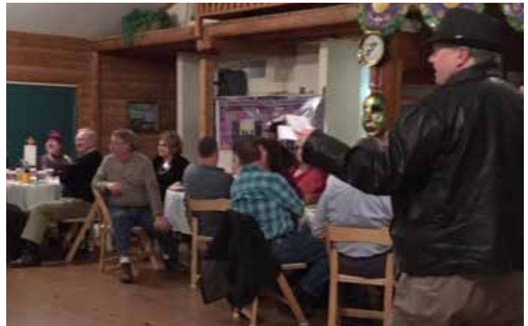
With the help of the detective collecting clues during the six-course dinner, the mystery murder was solved.

Old scores are settled and family secrets are exposed when Pierre DuPre, the King of the Krewe, is murdered. The party guests must work together to determine who strangled the Mardi Gras King with a priceless vintage necklace!