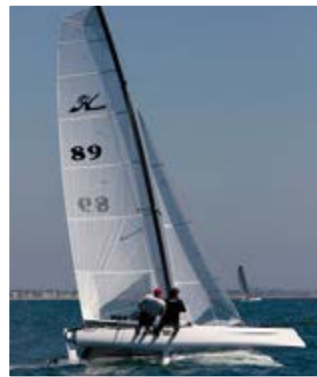
A Hobie Wild Cat mak

Hobie received the Waterman Achievement award from the Surfing Industry Manufacturers Association in 1993, was inducted into the Huntington Beach Surfing Walk of Fame in 1997 and admitted as an inaugural member of the National Sailing Hall of Fame in 2011 alongside Dennis Connor and Ted Turner.