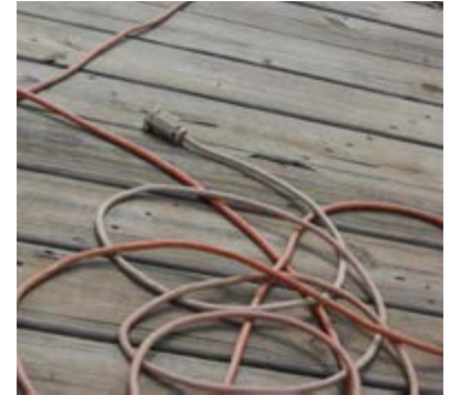
Above: Examples of electrical cords, on the slips, that are not in compliance with the state regulations and will be removed.