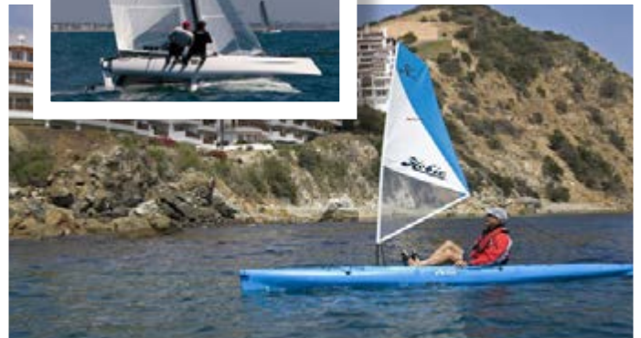
The Hobie Mirage Adventure under sail