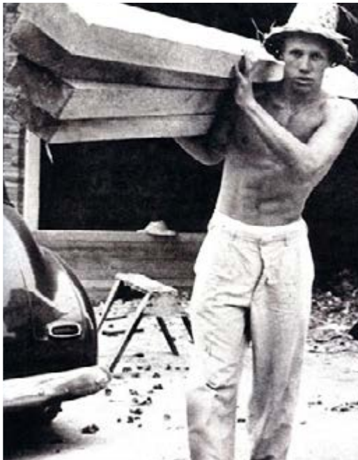
Alter in his early surfboard days.