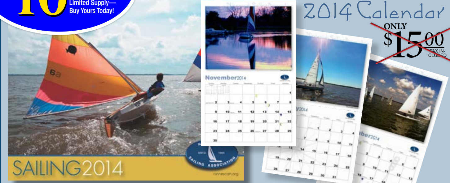
Ninnescah Sailing Association 2013 Photo Contest Entries