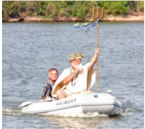
King Neptune arrives blowing his conch Sunday afternoon, as part of our Labor Day festivities.