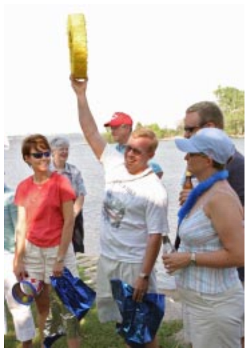
Our new members are properly initiated into NSA at our annual ceremony.