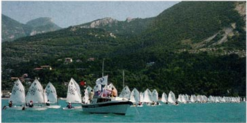
Start Line at Lake Garda, Italy

$40 per person includes: Wine & Cheese Tasting, 4-Course Dinner, Dessert, and Murder Mystery Show