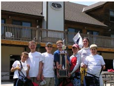
Team NSA 2004

Team Ninnescah grew to 7 sailors this year, and became the powerhouse team in CSSA. We brought the most sailors to each regional regatta, and we took home the most trophies! We hosted this year's CSSA Championship Regatta in August. Our team placed 1 st , 2 nd , 3 rd , and 8 th in the Optimist Experienced fleet; 2 nd and 3 rd in the Optimist Beginner fleet; and 4 th in the Sunfish fleet. It was an exciting year, and we are very proud of our sailors.