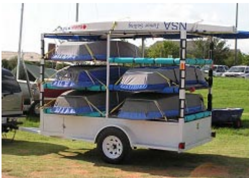
Loaded up at the OCBC regatta in July