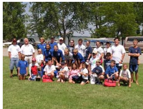
Sailors at the CSSA Championship Regatta NSA - August, 2004